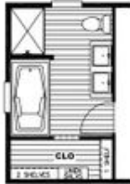
BATH OPT. 2